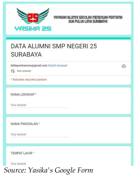
Figure 4. Forms that are Distributed Online

The sixth social marketing communication is Interactive marketing. Yasika 25 implements various marketing strategies, including interactive marketing, which aims to increase awareness, image, and sales of products or services through online activities and programs that engage customers or prospects directly or indirectly. Yasika 25 uses active social media accounts such as Instagram with the username yasika25sby, Facebook with the username Yasika25sby, and Facebook with the username Yasika25sby, Spenduma, and a Facebook Fanspage page under the name Yayasan Alumni SMP 25 Surabaya. In addition, Yasika 25 also has a YouTube channel under the name YASIKA 25 to utilize its online presence to strengthen relationships with customers or prospects and increase interaction with them.