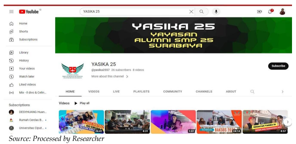
Figure 5. Youtube Yasika 25

The sixth social marketing communication is Interactive marketing. Yasika 25 implements various marketing strategies, including interactive marketing, which aims to increase awareness, image, and sales of products or services through online activities and programs that engage customers or prospects directly or indirectly. Yasika 25 uses active social media accounts such as Instagram with the username yasika25sby, Facebook with the username Yasika25sby, and Facebook with the username Yasika25sby, Spenduma, and a Facebook Fanspage page under the name Yayasan Alumni SMP 25 Surabaya. In addition, Yasika 25 also has a YouTube channel under the name YASIKA 25 to utilize its online presence to strengthen relationships with customers or prospects and increase interaction with them.