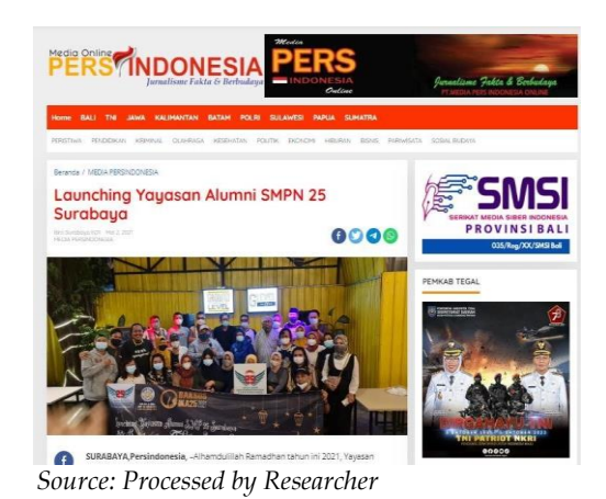
Figure 3. One of the Publications in Online Media

activities, SMPN 25 Surabaya alums can improve their good image and strengthen community relationships, increasing awareness and public trust in the foundation they built. Some publications that have been published on such as <a href="https://persindonesia.com/2021/05/02/launching-yayasan-alumni-smpn-25-surabaya/">https://persindonesia.com/2021/05/02/launching-yayasan-alumni-smpn-25-surabaya/</a> and <a href="https://surabaya.tribunnews.com/2020/04/24/alumni-smp-25-surabaya-gelar-aksi-sosial-jelang-psbb-bagi-bagi-masker-dan-takjil">https://surabaya.tribunnews.com/2020/04/24/alumni-smp-25-surabaya-gelar-aksi-sosial-jelang-psbb-bagi-masker-dan-takjil</a>